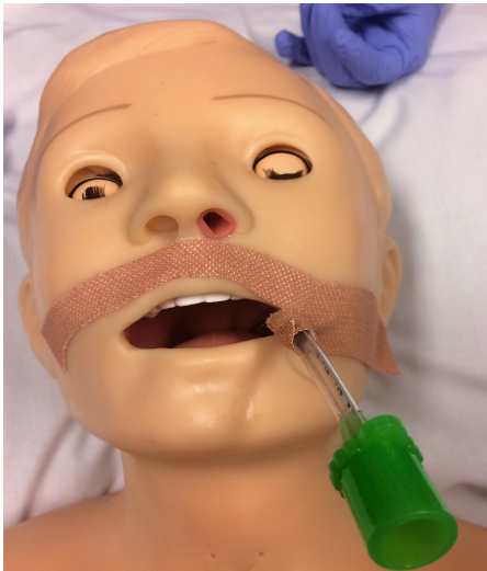
Step 5. After two anchoring turns, wind the tape up the ETT by 1-3cm