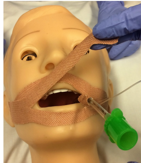
Step 7. Place the lower leg under the lower lip. Bring the top leg over the upper lip, down and around the ETT