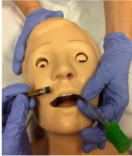
Step 2. Apply Benzoin tincture to all areas to be covered with Elastoplast firmly