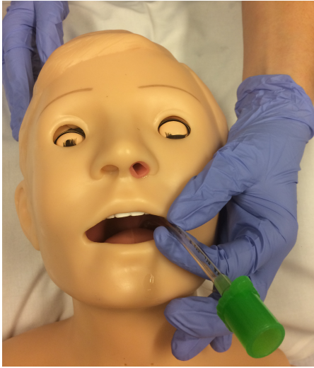
Step 1. Clean the mouth, place ETT in left corner of mouth and hold firmly