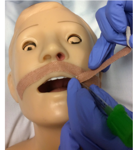
Step 4. Place the top leg under the nose but avoid the lip. Bring the lower leg tight around the ETT