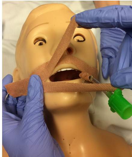
Step 6. Place the second tape at the corner of the mouth opposite the ETT