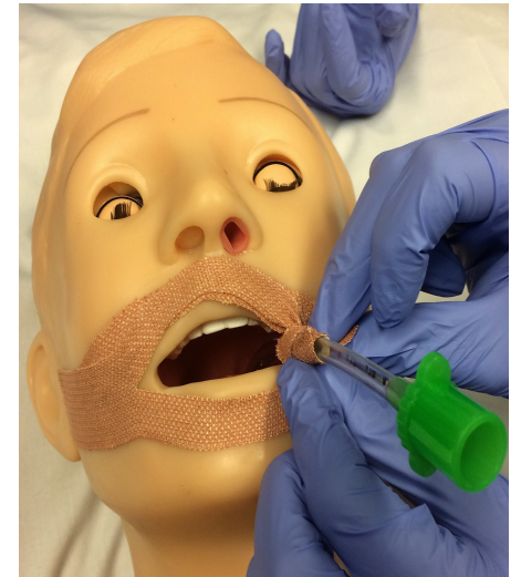
Step 8. After 2 anchoring turns, wind up the ETT and leave a small turn in the tape to allow easy release