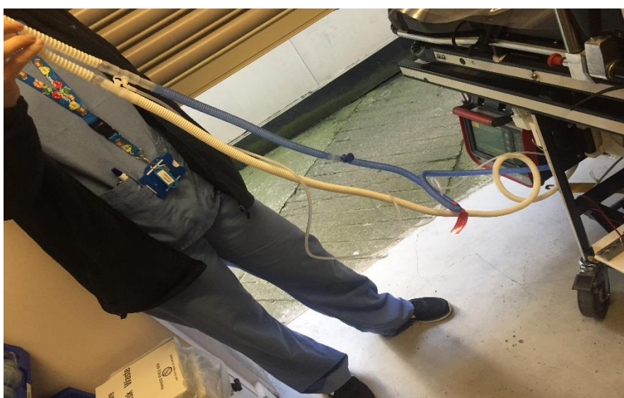
Complete set up of tubing