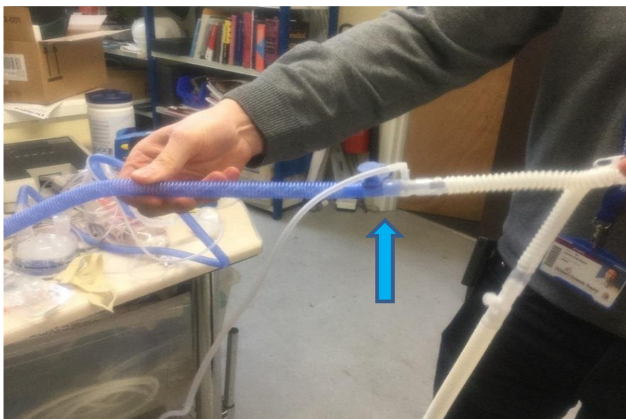
Pressure line attached onto clear plastic port on the inspiratory limb (blue)